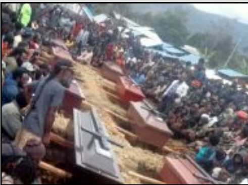
Massacre in Wamena, 2003

Indonesian anti-terror units are funded by the international community, including Australia, but in West Papua they are used to search for political activists, especially those agitating for independence.