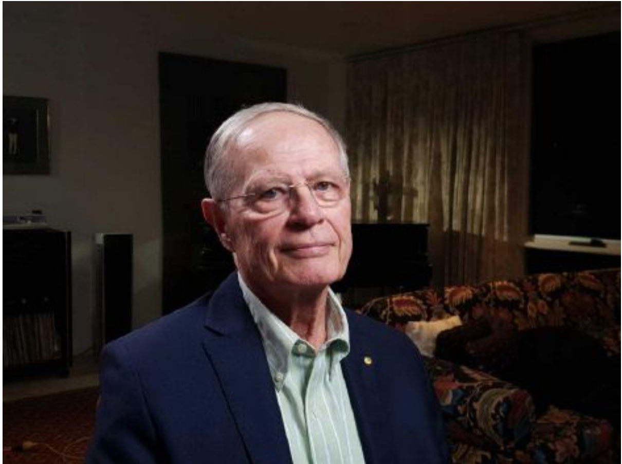
Former Defence chief Chris Barrie says legal transparency is a democratic building block.

Former ADF chief Chris Barrie has also argued for an open trial.